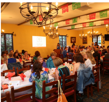
Annual Meeting Attendees