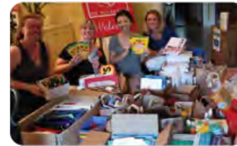
Done in a Day