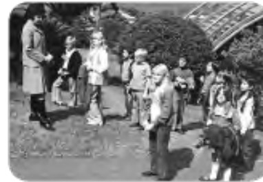
Huntington Art Gallery Docents