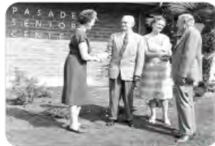
Pasadena Senior Center