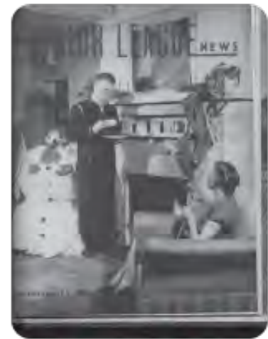
Junior League of Pasadena was founded in 1926

Since 1926, the Junior League of Pasadena has formed or assisted in forming over 130 organizations and programs, and given over $5,000,000 back to our community. This timeline displays just a small sampling of the positive community impact we have made in the San Gabriel Valley.