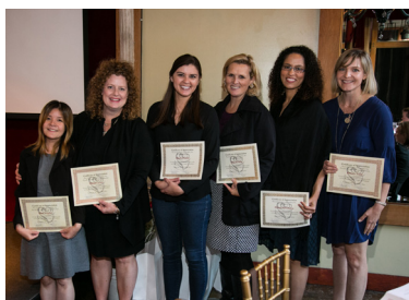
Members with 5 and 10 Active Years