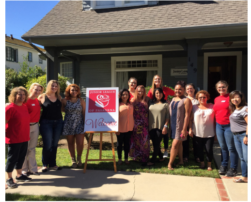
Participants and JLPers at one of the first WCWs

Workshops, we also provide an indirect service opportunity for members to donate items for the "Interview Prep Kits" which are given to each woman who attends the workshop. The Interview Prep Kit includes a leather padfolio, resume paper, thank you stationary, pens, and a goal planner. This year we expanded the kit to include wellness and hygiene items such as tips on breathing and mindfulness techniques, neutral nail polish and makeup, and breath mints.