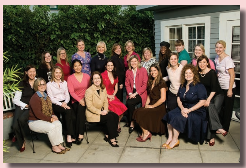
Thanks for a great year to the outgoing Council and Board!